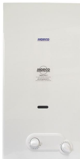
EUP 6 Litre & EUP 11 Litre

Hazard: RISK OF FIRE Please stop using the water heater immediately and isolate the gas supply to the appliance