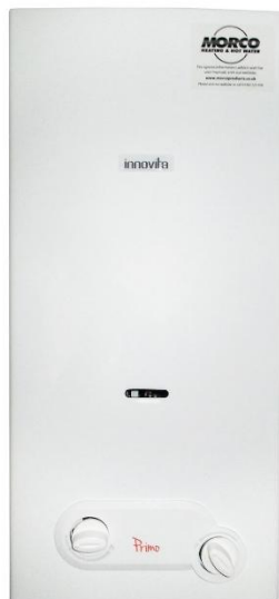
Primo 6 Litre (MP6) & Primo 11 Litre (MP11)